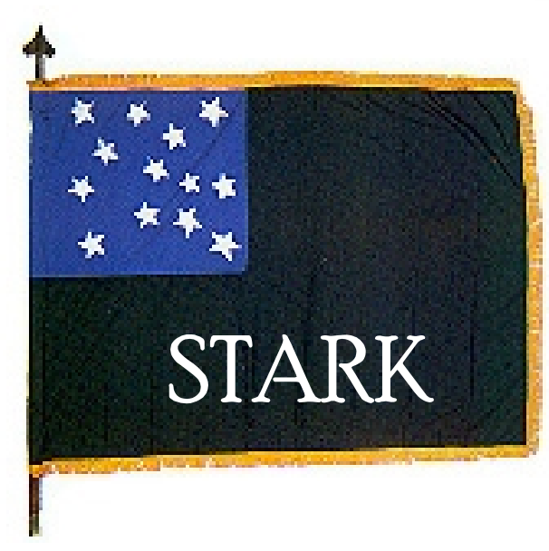
Stark's Brigade Standard